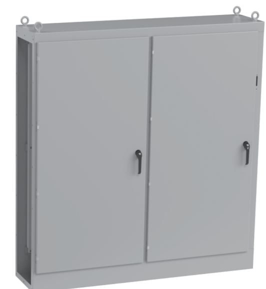
2DR Right XM