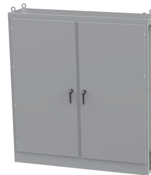
2DR Left XM